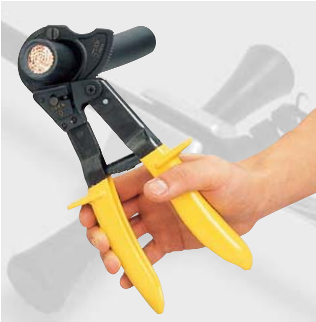
IZ-325A shown with CV 325mm 2 Cu Cable